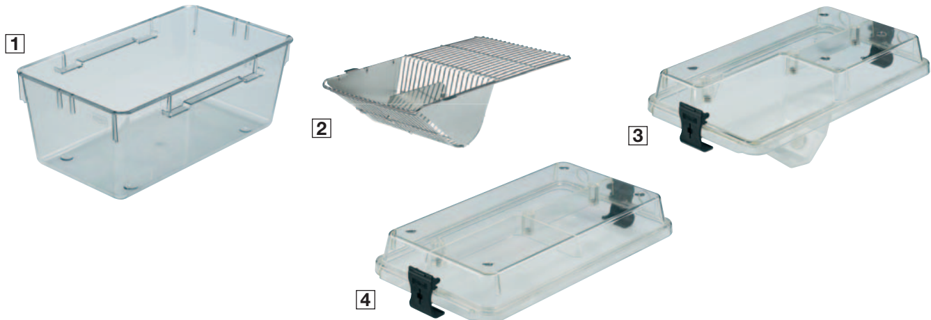
1 Cage type II L 2 Stainless steel cover for filter hood, inside-located 3 Filter hood, bottle outside 4 Filter hood, bottle inside